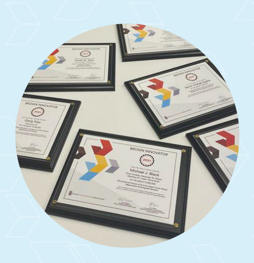
Issued patent plaques are given to both inventors and their departments for display.

Provide excellent service to the faculty customer and manage intellectual property budget to maximize benefit to investors and inventors